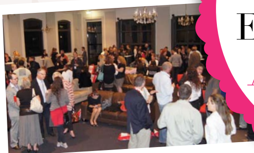
My Child Excellence Awards night 2012