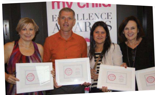
...and with the Pumpkin Patch team

AFTER THOUSANDS OF ENTRIES WE'RE EXCITED TO ANNOUNCE THE WINNERS OF OUR MY CHILD EXCELLENCE AWARDS, WHICH WERE PRODUCED IN PARTNERSHIP WITH THE BABY & KIDS NATIONAL BUYERS SHOW